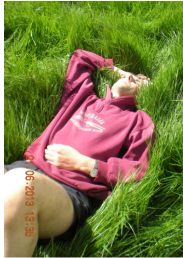
This is the life.