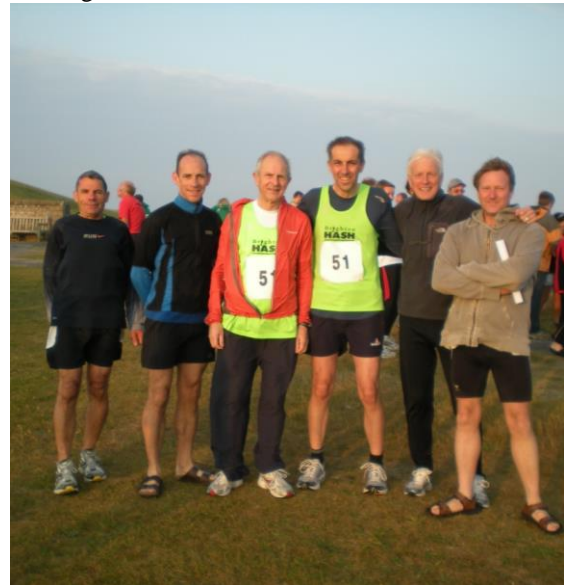
HASH VET's Team 2011