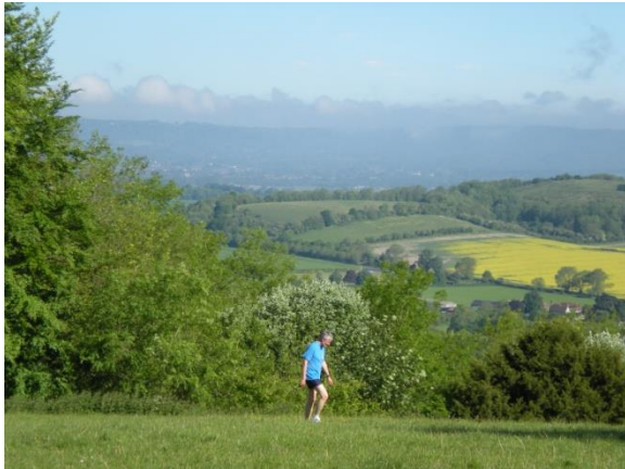
Harting Hill is the most glorious CP.