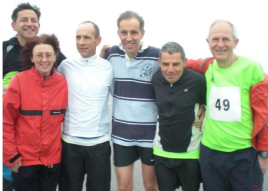
HASH VET's Team 2012