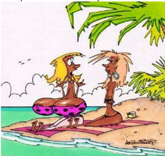
My legs just never seem to tan.

"No" she replies. "This time it's mayonnaise"