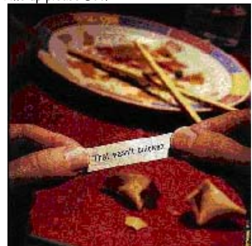
That wasn't chicken!

"Yes!" says the Chinese doctor, "You no worry! Wait two weeky. Dick fall off by itself!"