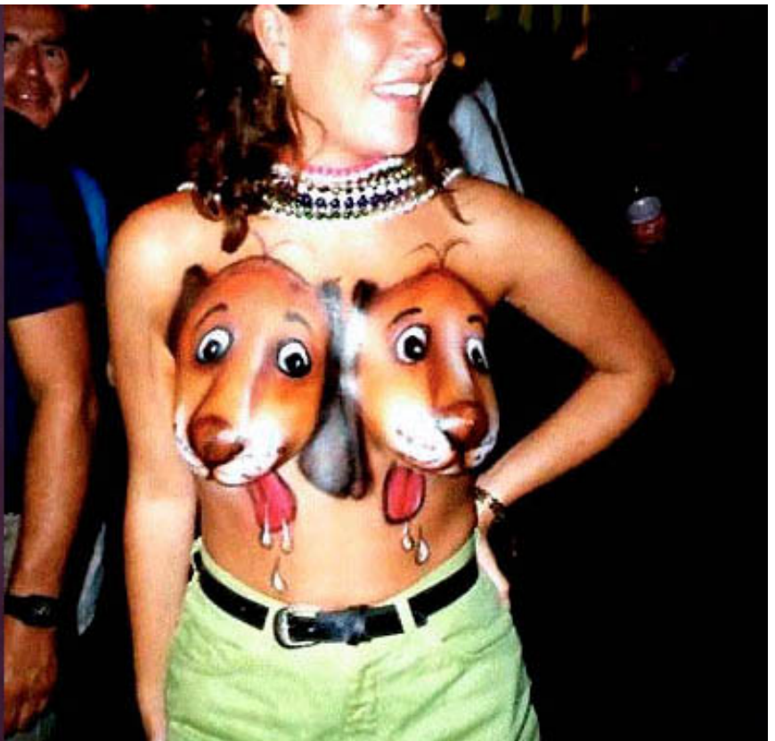
Would you like to stroke my puppies!